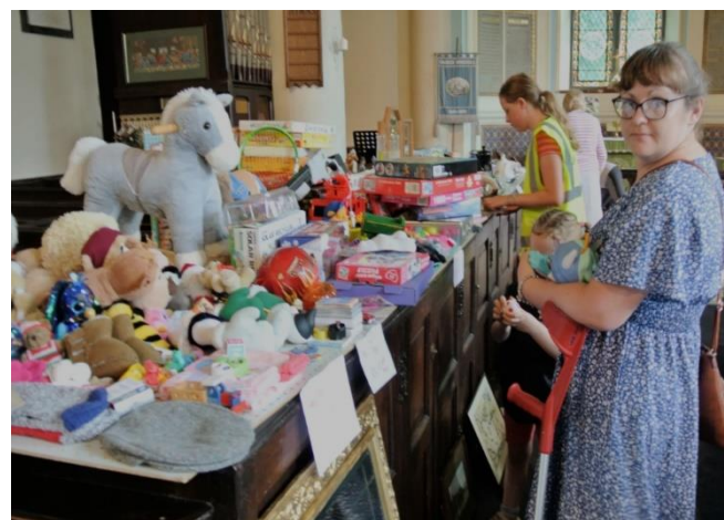
Just browsing !