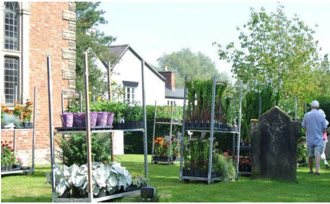
The plants were delivered