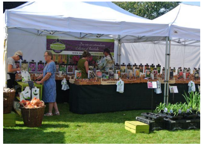
The Bulb stall was the usual outstanding success with everything supplied direct from the Netherlands