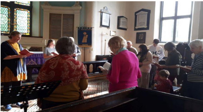
Chair of Partners in World Mission